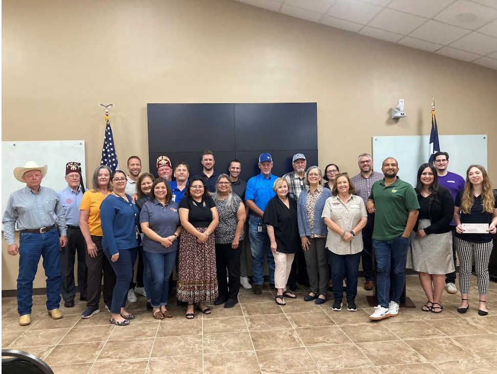
Ladies Lunch at TSA 2023

Pedernales Electric passed out checks to all 501c3 groups selected by the employees. Ben Hur has been privileged to receive a check for the Galveston Hospital for many years. Thank you PEC for your generous donation.