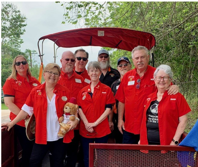
RUH NEB NILE INSTALLATION