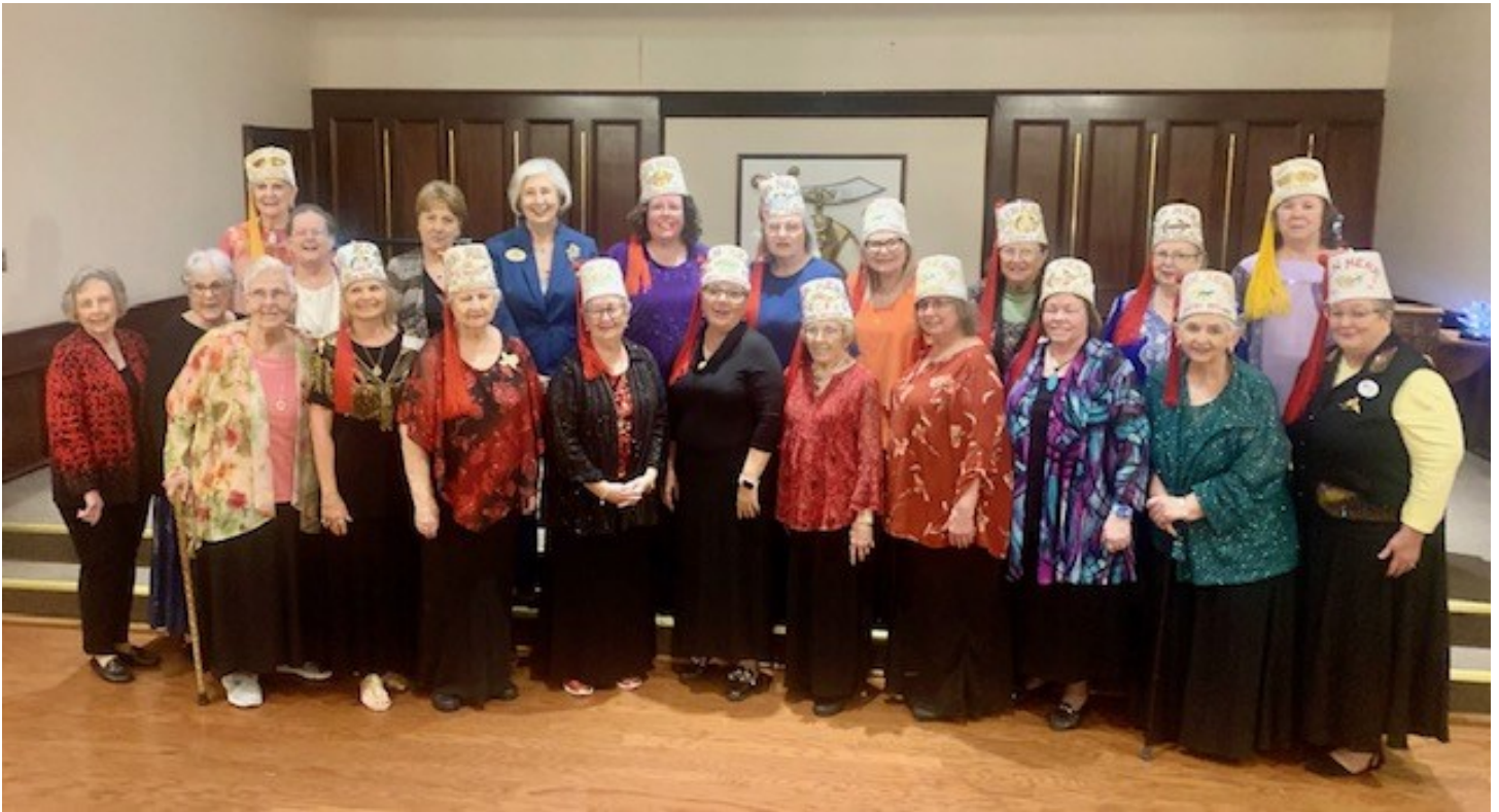
BEN HERA INSTALLATION