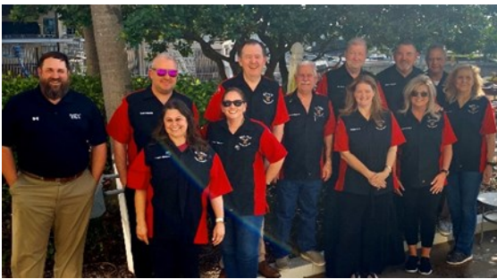
The TSA counterparts at OG School in Tampa, FL

One of the big topics of the OG school was shrinking membership and participation. The question is what are we going to do about it? I know our membership committee works very hard to attract new members, but it is going to take more of us. It is going to take ALL of us stepping out and finding new members. In the past 10 years, there have been more than 9800 Master Masons raised in the Grand Lodge of Texas. In that same time, we have created 313 new Nobles. The good news is I think that we have a lot of potential new Nobles out there, we just need to find a way to reach them and show them how the fun and fellowship of the Shrine can contribute to their Masonic journey.