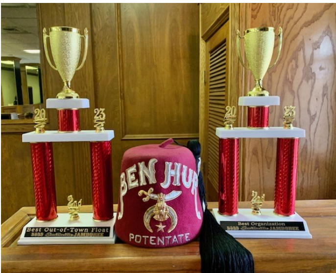
SMITHVILLE PARADE HONORS