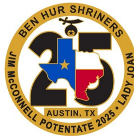
Ben Hur Shrine Austin, TX Boars of Directors