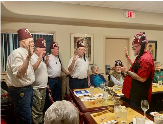
Newly installed Potentate visits HLSC to Install the Clubs officers.